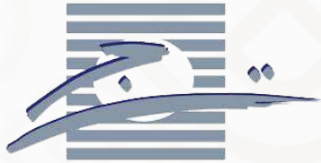
Université de Tunis

The University of Tunis was founded in 1960 and is today, with approximately 20,000 students, one of the largest universities in Tunisia. It has a vast research and teaching portfolio and boasts a reputation of excellence in research throughout the region.