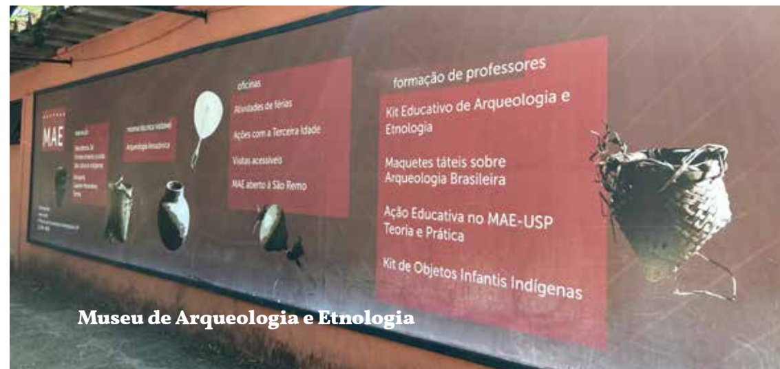
Museu de Arqueologia e Etnologia