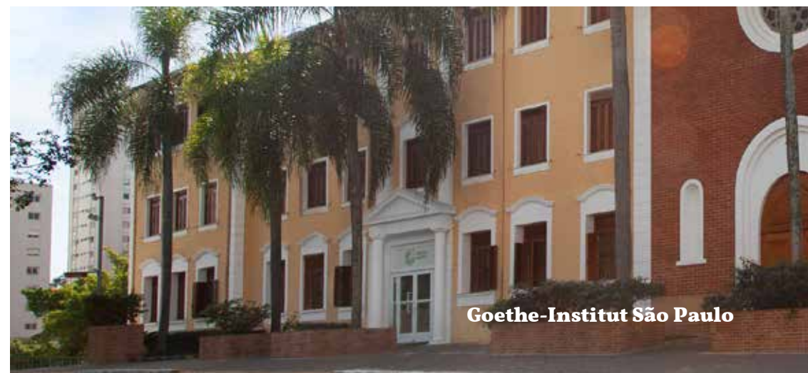
Goethe-Institut São Paulo